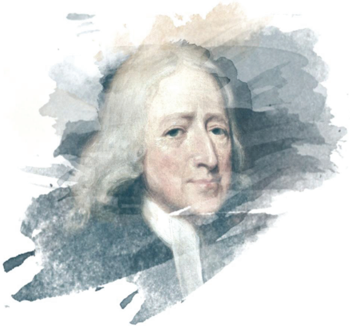
John Wesley, 1703-1791 Founder of Methodist Movement